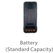
Battery (Standard Capacity)