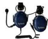
Intrinsically Safe Hamlet Heavy Duty Noise-cancelling Headset kit